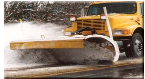
End of Storm

Snow and ice removal operations shall remain in effect on a 24-hour per day basis until the above-mentioned objectives are met and sustained for both first and second priorities.