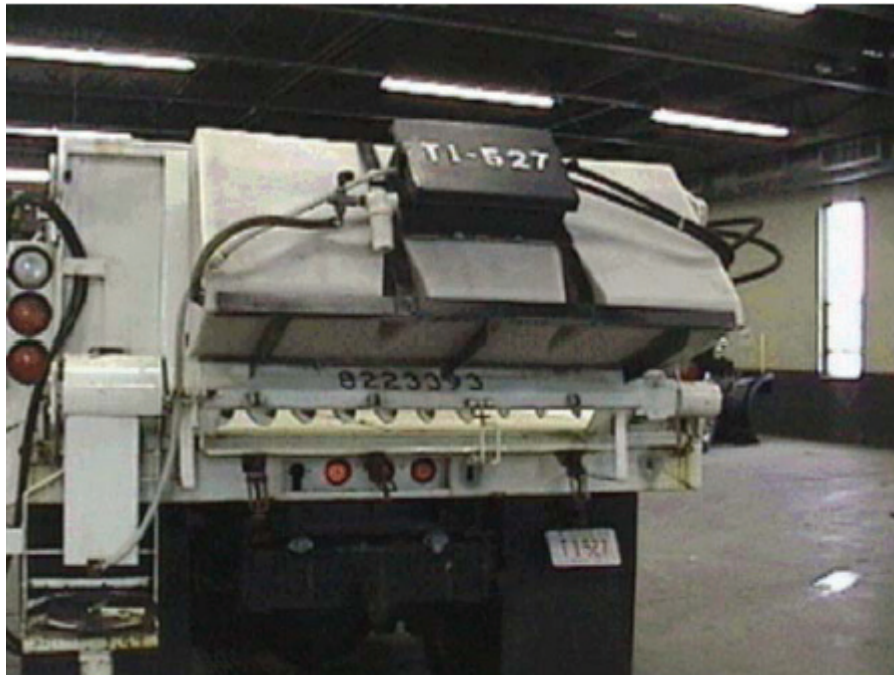
Figure 12-13 Tailgate mounted brine tank